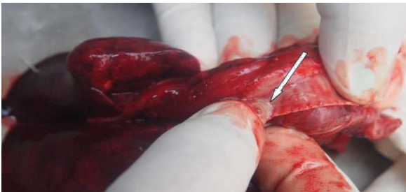
Figure 2 Fluid (milk) present in trachea.